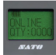
Large LCD Display (802.11 b/g model)