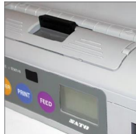
Top Cover Opening for Easy Media Load