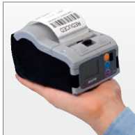
Small & Light Durable & Dependable

Quick and Durable. Ultimate Performance and Mobility.