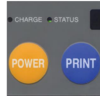
Large Operator Control Buttons